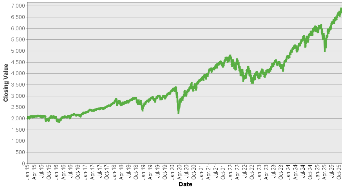
S&P 500® Index – Historical Closing Values January 2, 2015 to December 1, 2025

The graph below shows the closing value of the S&P 500® Index for each day such value was available from January 2, 2015 to December 1, 2025. We obtained the closing values from Bloomberg L.P., without independent verification. You should not take historical closing values as an indication of future performance.